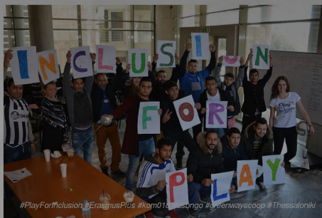
#PlayForInclusion #ErasmusPlus #kom018 #usbngo #greenwayscoop #Thessaloniki