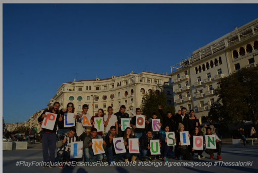
#PlayForInclusion #ErasmusPlus #kom018 #usbngo #greenwayscoop #Thessaloniki